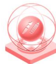
Creativity in the Visual Arts sector