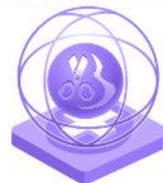
Creativity in the Design & Fashion