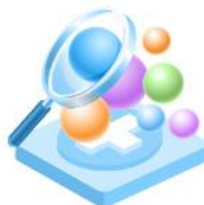
Innovation ideas in the CCS

This self-learning session consists of the 41 NOOCs (Nano open online courses) presented as short videos and aiming to deepen skills, corresponding to the seven above-defined sectors of CCS.