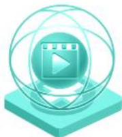
Creativity in the Audio-Visual Arts sector