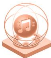
Creativity in the Music sector