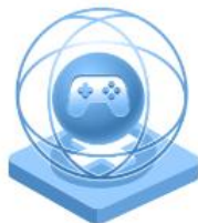
Creativity in the Games & Multi-media