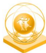
Creativity in the Performing Arts sector